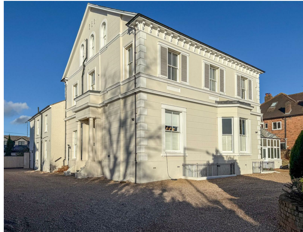
Beautiful One-Bedroom Apartment Near Town Centre

This charming one-bedroom property is located within a stunning building just a short walk from the town centre, offering convenient access to shops, restaurants, and other amenities.